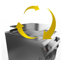
Plate not welded to the machine bed with optimisation of structural points under thermal stress

Brushed chrome plate surface designed to resist scratches and facilitate daily cleaning. complies with Regulation (EC) No. 1935/2004