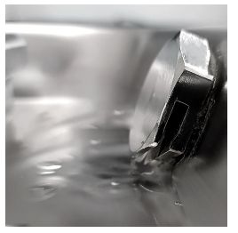
Water dispenser kit available as an accessory