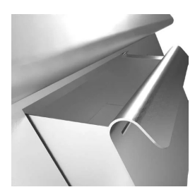
Large fat collection drawer with capacity of the entire volume of the perimeter channel