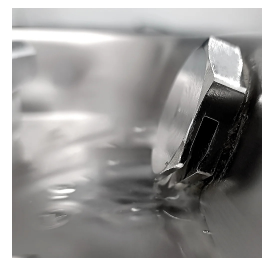
Water dispenser kit available as an accessory