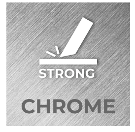
Brushed chrome plate surface designed to resist scratches and facilitate daily cleaning. complies with Regulation (EC) No. 1935/2004