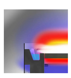
Thermal cutting that facilitates the user and adjacent machinery.