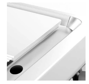
Floodable gutter for collecting cooking residues around the perimeter of the cooking plate easier cleaning and better retention of moisture in cooking food