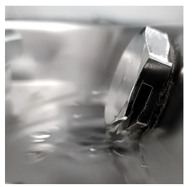
Water dispenser kit available as an accessory