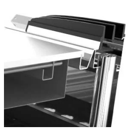
Plate not welded to the machine bed with optimisation of structural points under thermal stress