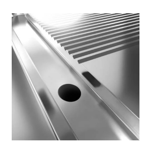
Grooved plate design ensures cleanliness right to the end of the plate