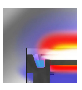
Thermal cutting that facilitates the user and adjacent machinery.