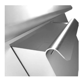
Large fat collection drawer with capacity of the entire volume of the perimeter channel