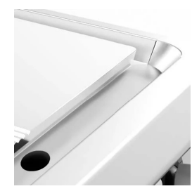
Floodable gutter for collecting cooking residues around the perimeter of the cooking plate easier cleaning and better retention of moisture in cooking food