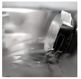
Water dispenser kit available as an accessory