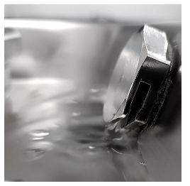
Water dispenser kit available as an accessory