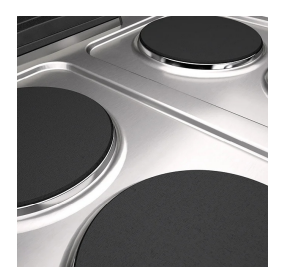
The range offers cookers with 220 mm round plates and 2.6 kW of power or 220x220 square plates and 2.6 kW fixed watertight on the worktop.