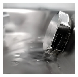
Water dispenser kit available as an accessory