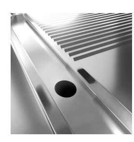
Grooved plate design ensures cleanliness right to the end of the plate