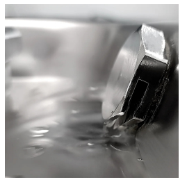
Water dispenser kit available as an accessory