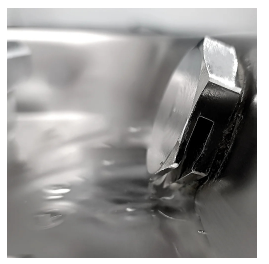
Water dispenser kit available as an accessory