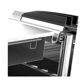
Plate not welded to the machine bed with optimisation of structural points under thermal stress

Floodable gutter for collecting cooking residues around the perimeter of the cooking plate easier cleaning and better retention of moisture in cooking food