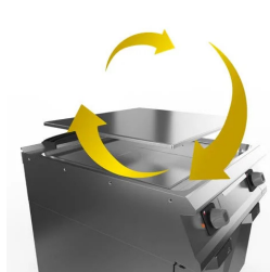
Plate not welded to the machine bed with optimisation of structural points under thermal stress

Brushed chrome plate surface designed to resist scratches and facilitate daily cleaning. complies with Regulation (EC) No. 1935/2004