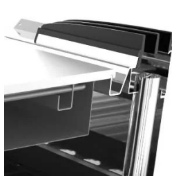
Plate not welded to the machine bed with optimisation of structural points under thermal stress

Floodable gutter for collecting cooking residues around the perimeter of the cooking plate easier cleaning and better retention of moisture in cooking food