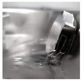
Water dispenser kit available as an accessory