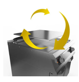
Plate not welded to the machine bed with optimisation of structural points under thermal stress