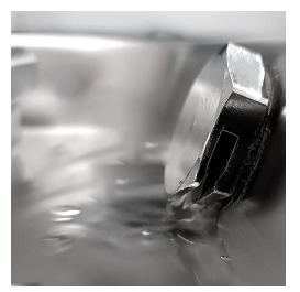
Water dispenser kit available as an accessory