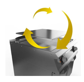
Plate not welded to the machine bed with optimisation of structural points under thermal stress

Uniform cooking temperature across the entire plate. Optimising heat in the cooking area and increasing operator comfort in the kitchen.