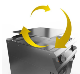
Plate not welded to the machine bed with optimisation of structural points under thermal stress

Uniform cooking temperature across the entire plate. Optimising heat in the cooking area and increasing operator comfort in the kitchen.