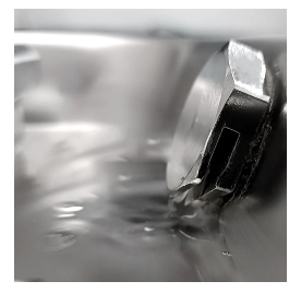
Water dispenser kit available as an accessory