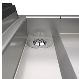
Table top with standardised tank and liquid drainage in the rear right-hand corner.

10 kW or 14 kW enameled cast-iron burners removable for easy cleaning.