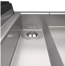
Table top with standardised tank and liquid drainage in the rear right-hand corner.

10 kW or 14 kW enameled cast-iron burners removable for easy cleaning.