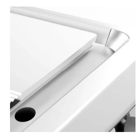
Floodable gutter for collecting cooking residues around the perimeter of the cooking plate easier cleaning and better retention of moisture in cooking food