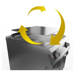
Plate not welded to the machine bed with optimisation of structural points under thermal stress