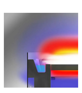
Thermal cutting that facilitates the user and adjacent machinery.