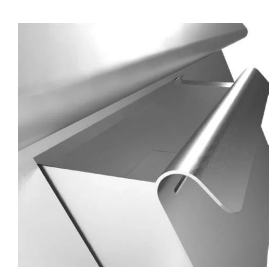
Large fat collection drawer with capacity of the entire volume of the perimeter channel