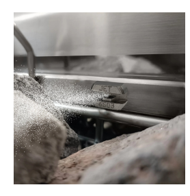
HUMIDIFIER accessory for optimal management of several types of cooking.