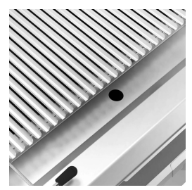
Larger, recessed grease trough on the worktop, easier to clean and more capacious

4 Grill types available: meat, fish, mixed stainless steel and reversible cast iron meat/fish version